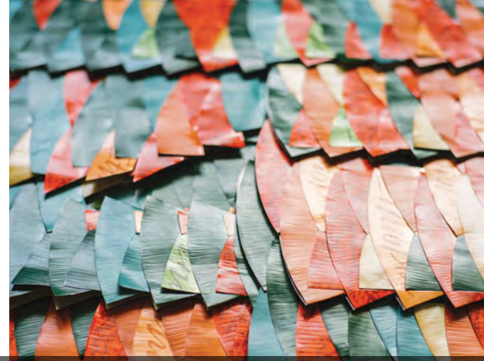
Red Hong Yi's art installation, 'Kaleidoscope', was made with 24,000 used NESPRESSO coffee capsules, reflecting creative ways to reduce, reuse and recycle with the NESPRESSO brand.