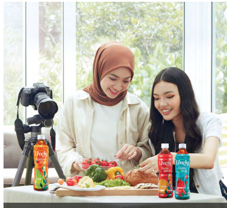
LIVELY Tea, Nestlé's first RTD tea drink with adaptogens, enabling consumers to "Reflect, Refresh and Recharge".

Broadening our portfolio of `better-for-you' products, we penetrated the RTD tea drinks segment with our new Nestlé LIVELY Tea range. Our three black tea variants of Orange Guarana Tea, Raspberry Lemon Balm Tea and Pear Schisandra Tea are low in sugar and infused with adaptogens, ingredients derived from traditional herbs and fruits that have been used for centuries across different cultures around the world because of their beneficial effects in supporting the body's natural ability to cope with stress. With the hectic lifestyle many Malaysians face on a daily basis today, the refreshing and stimulating benefits of these innovative drinks offer consumers a modern, convenient and great-tasting way to drive the stress away.