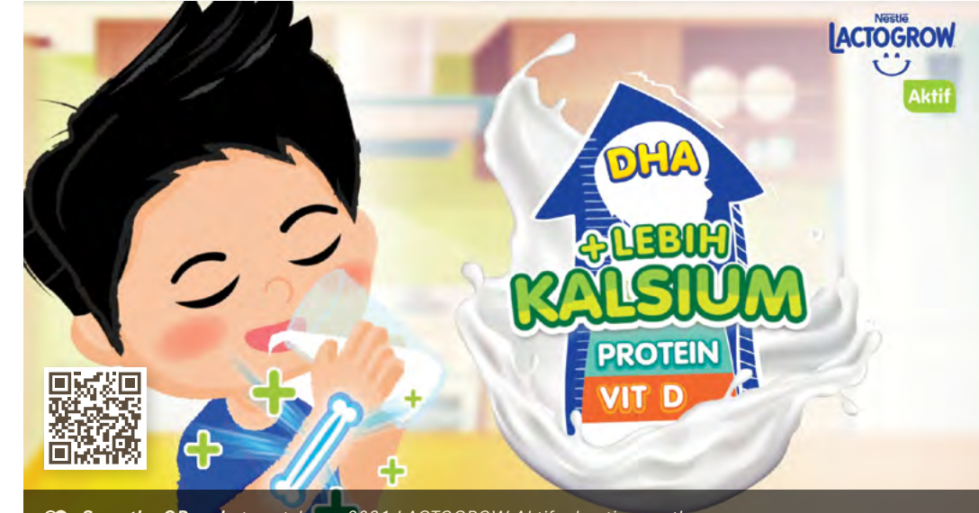
C Scan the QR code to catch our 2021 LACTOGROW Aktif advertisement!

Sporting a refreshed look that enhances brand appeal, LACTOGROW Aktif continues to deliver the same nutritional goodness. To drive awareness on the revamped range, we held a virtual media launch featured on popular mainstream news programme, TV3 Buletin Utama. We also partnered with Billion supermarket in Semenyih for a livestream segment on Shopee Live to promote LACTOGROW Aktif and strengthen sales. As a result, we achieved significant double-digit organic growth in 2021 compared to 2020.