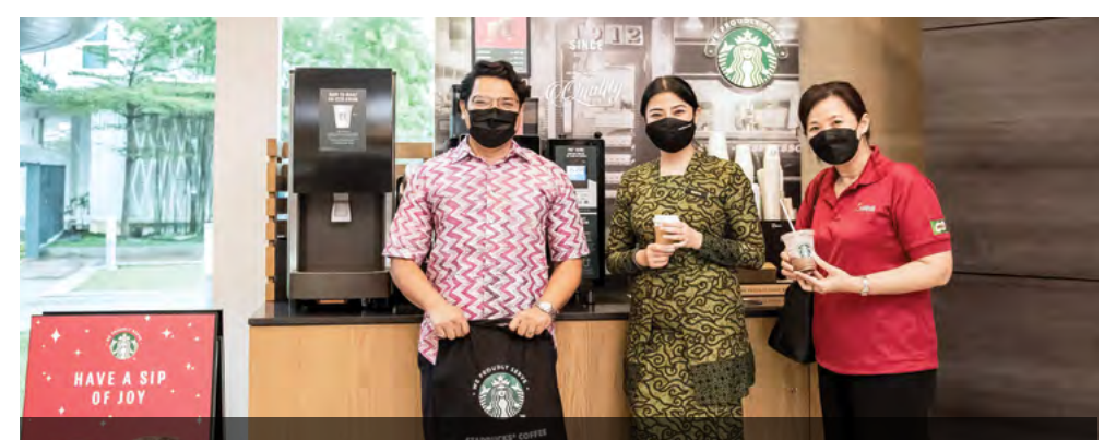
New machine placements enabled us to extend our WE PROUDLY SERVE STARBUCKS offerings to more consumers.

We will continue to work towards capturing stronger share of throat and accelerate recovery as OOH channels see better prospects ahead.