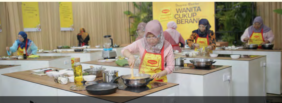
Inspiring Malaysian women to make a difference in their lives through our Resipi Berani MAGGI TV series.