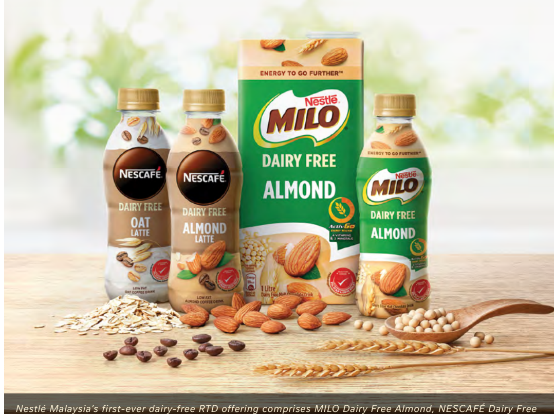
Nestlé Malaysia's first-ever dairy-free RTD offering comprises MILO Dairy Free Almond, NESCAFE Dairy Free Oat Latte and NESCAFÉ Dairy Free Almond Latte; the range is available in PET 225ml and UHT 1 litre multiserve formats, to cater for both in-home & on-the-go consumption.

Alongside growing our brands and expanding our product portfolio, we place great emphasis on spearheading sustainable solutions, namely through recycling initiatives and being the first large-scale manufacturer in Malaysia to convert our straws from plastic to 100% paper-based.